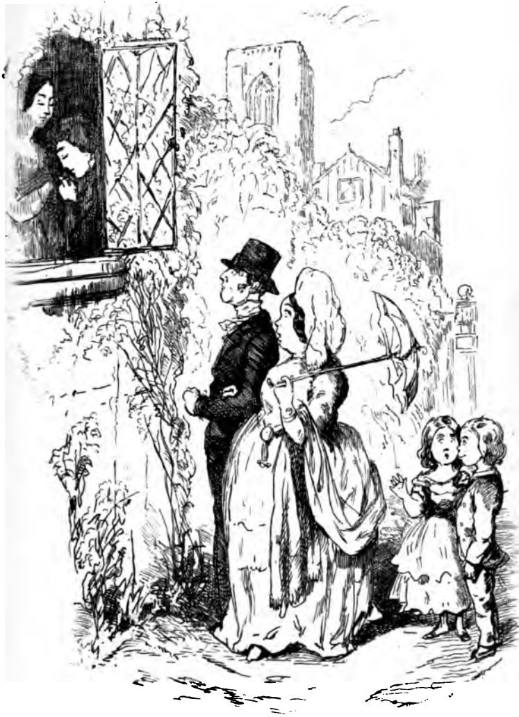
A VIEW FROM THE DEAN'S GARDEN